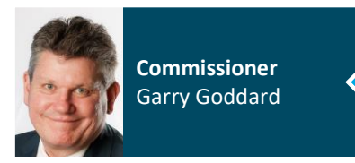
Commissioner Garry Goddard